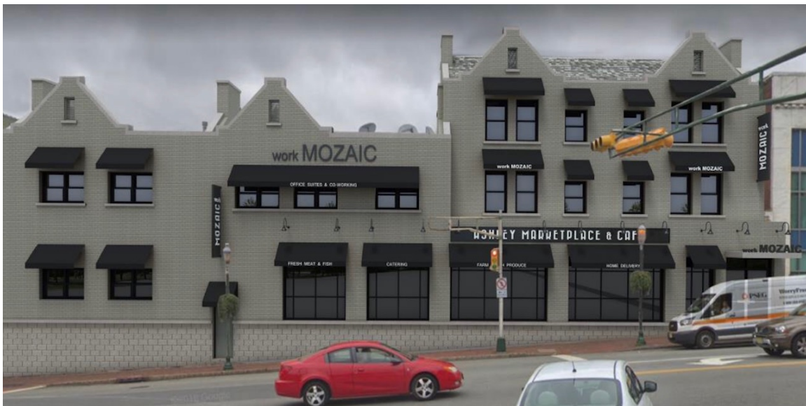
Figure 1: Applicants original submit

Painting of the building will be a wonderful update. The color referenced in the image that is a step darker and with a grey undertone complimenting the foundation stone looks good. We are happy to give feedback when the shade will be tested and finalized. On the second floor, the two additional gables that were added, we recommend centering gable (see figure 2), or eliminating the two left gables and continue the straight roofline. See figure 3 and 4 for reference.