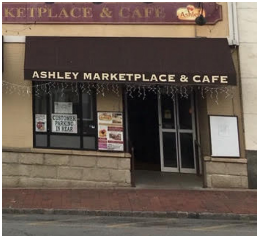
Figure 4: The image on the left below is showing current condition at the South Orange Avenue entrance. These pedestrian height light boxes could be updated into more attractive modern signage. The rendering below on the right shows how much clearer and attractive the entrance becomes. The rendering also shows how the canopy was extended over the window to the left to help define the entrance more.

Due to the scale of this building the awnings are a nice architectural detail. We would recommend the awnings on the first floor be a separate pattern. Something that feels more like a downtown food market. This design element instantly helps you understand that two businesses occupy this location. Design review board would be happy to review awning samples at a later date that could work. The colors selected need to compliment both businesses. See renderings above showing three complimentary options. Having more than two signs on the second floor does not seem necessary.