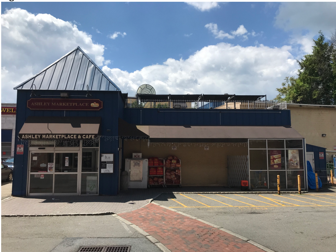
Figure 8: Current rear facade

Since there is also a light box already existing on the back entrance on the right side, mimicking the sign style from the front could be an effective option. The Ashley could then just have their sign updated like the front in the same location and recover the awning frame. The same style blade sign could be a nice option for the second floor. Due to the fact that the rear entrance and location of work Mosaic is not obvious, signage would be helpful. Any signage taller than the current Ashley rear sign, we would not recommend be illuminated since the Avenue apartments are right next-door.