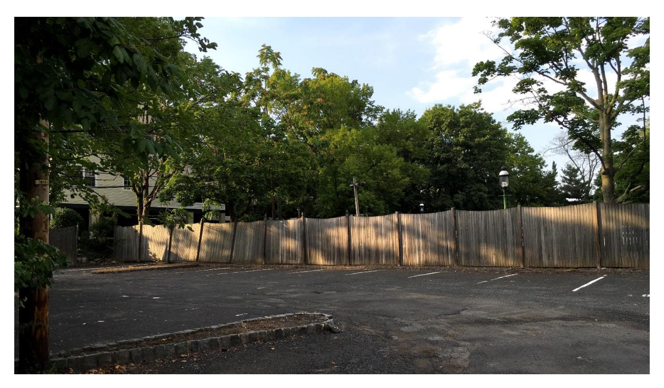
Figure 7 – View of commuter parking lot (taken August 11, 2020)