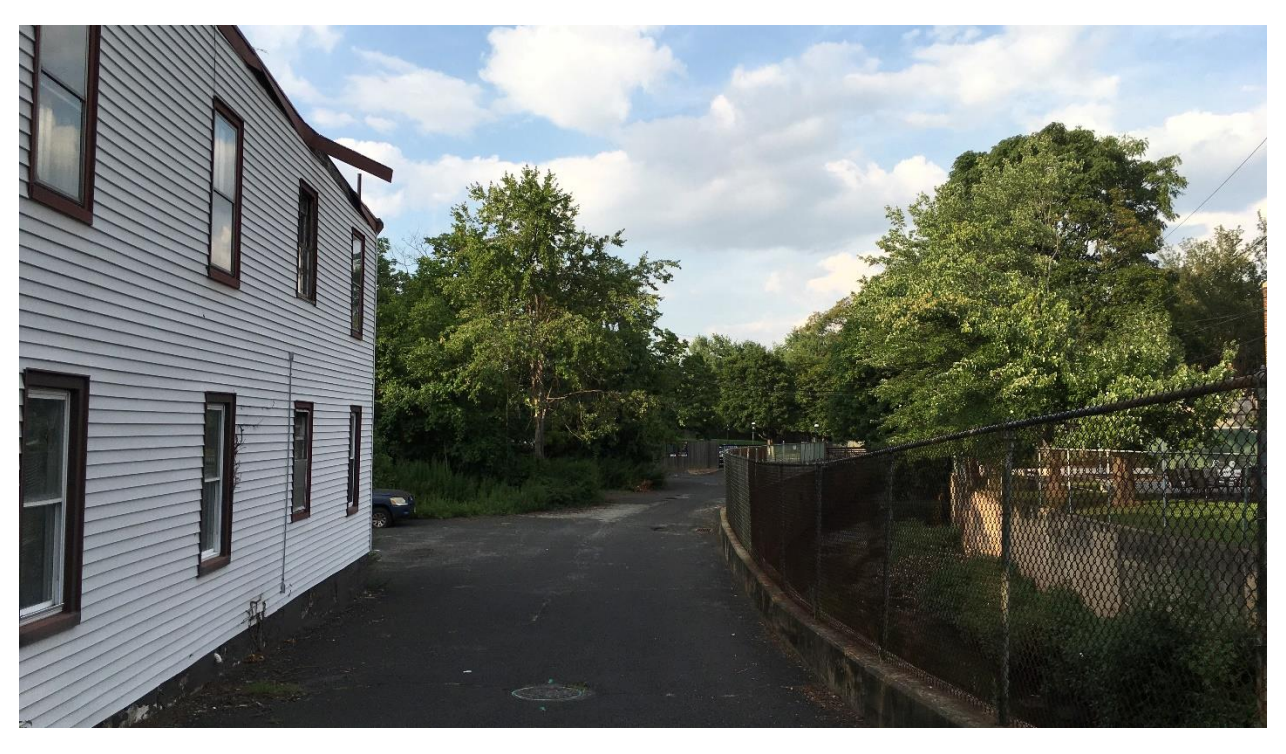
Figure 4 – View of continued drive sequence along access next to East Branch Rahway River (taken August 11, 2020)