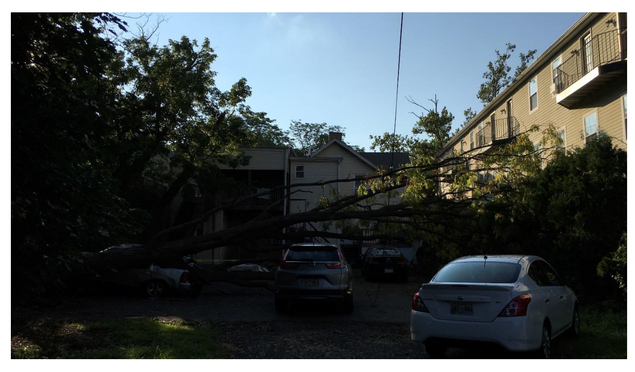
Figure 10 - View of parking area behind subject site to be removed due to lack of access easement found (taken August 11, 2020)