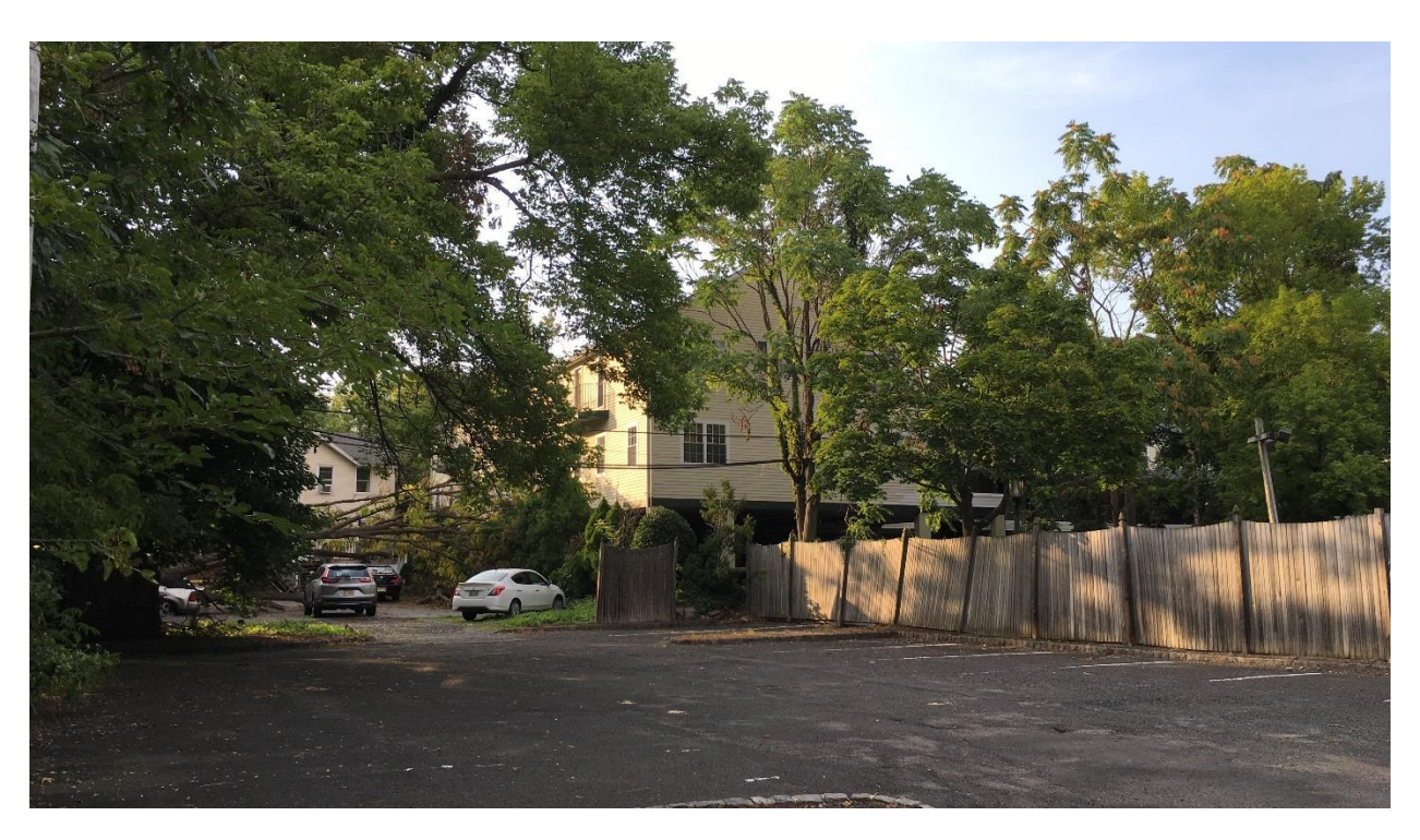
Figure 8 – View of commuter parking lot in relation to back of subject dwelling (on left) – taken August 11, 2020)