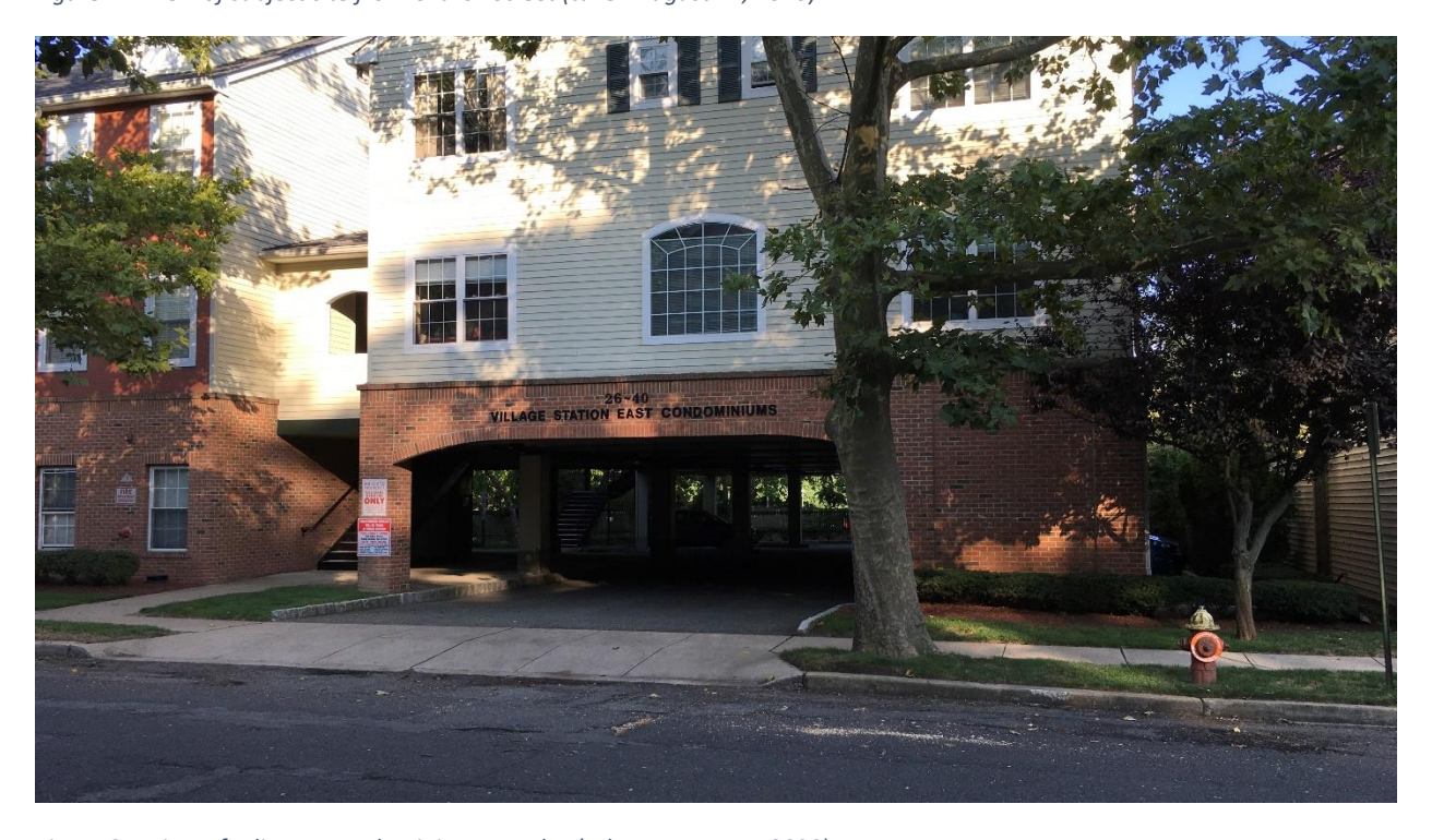
Figure 2 – View of adjacent condominium complex (taken August 11, 2020)