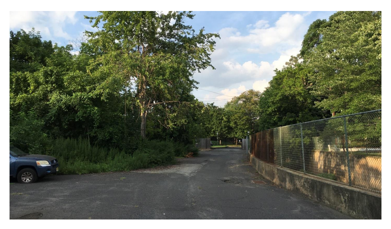
Figure 5 - View of continued drive sequence along access next to East Branch Rahway River (taken August 11, 2020)