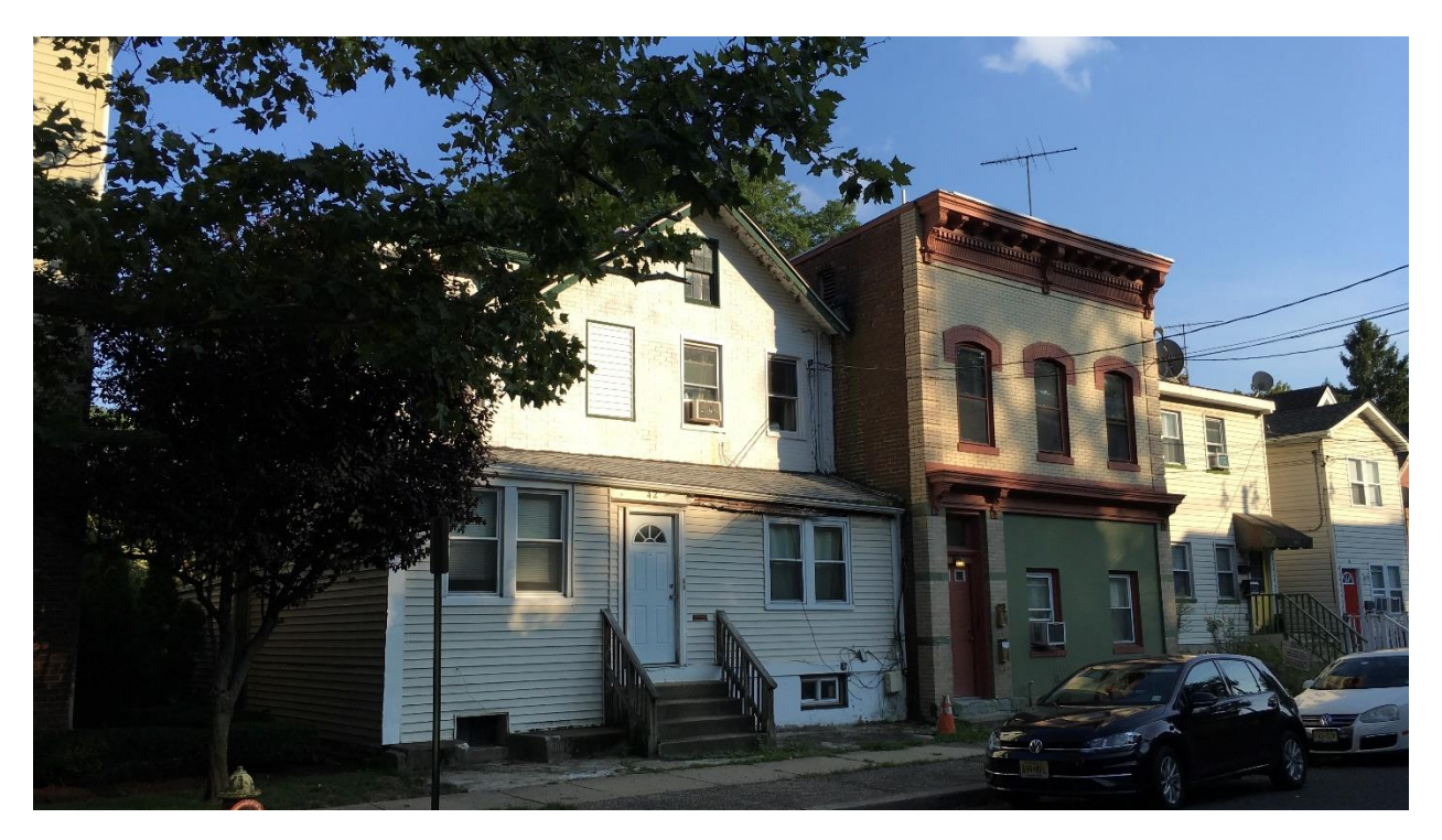
Figure 1 – View of subject site from Church Street (taken August 11, 2020)