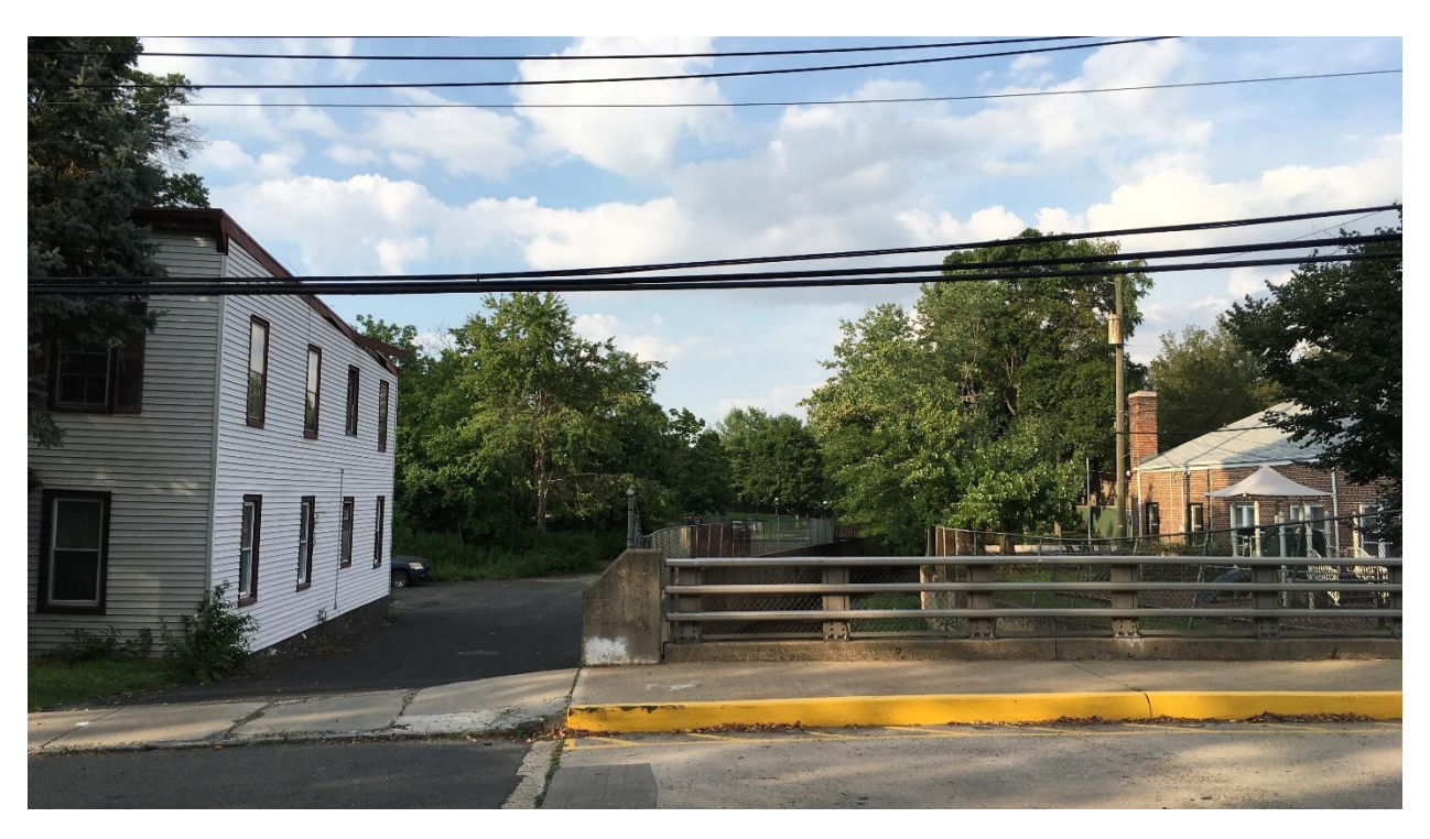
\textit{Figure 3-View of existing access off West 3}^{\textit{rd}} \, \textit{Street along East Branch Rahway River (taken August 11, 2020)}