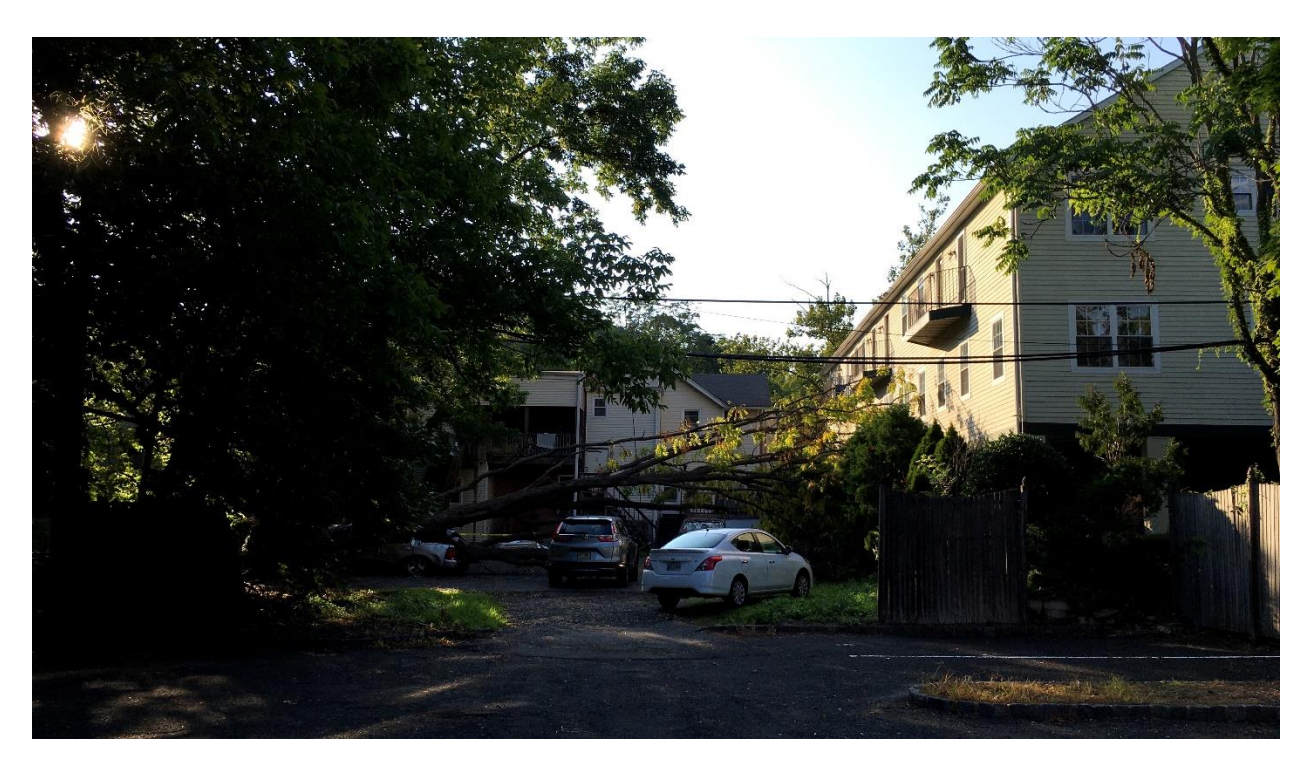
Figure 9 – View of parking area behind subject site to be removed due to lack of access easement found (taken August 11, 2020)