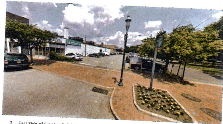
2. East Side of Existing Building